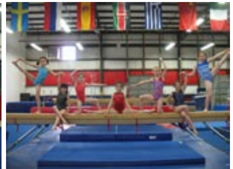
Place to learn & Grow