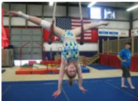
End Of The year Show