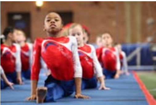
State Championship Teams